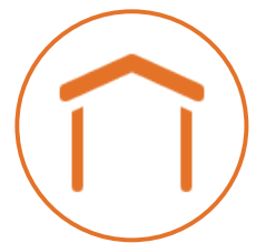
Fire Door Placement