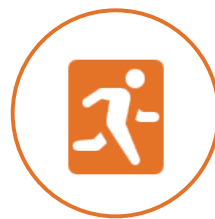
Fire Door Signs